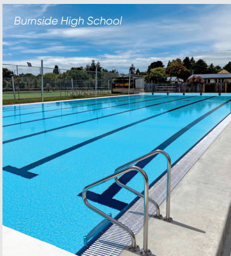
Burnside High School

COMMERCIAL AND RESIDENTIAL AQUATICS SPECIALISTS POOL REFURBISHMENT AND MEMBRANE INSTALLATION POOL WATER DISINFECTION PUMPING AND FILTRATION POOL HEATING THERMAL POOL COVERS ROBOTIC POOL VACS CHEMICALS AND TESTING EQUIPMENT POOL DECK HARDWARE SAUNA AND STEAM