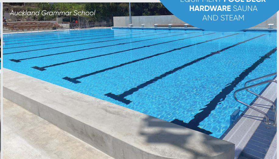
Auckland Grammar School