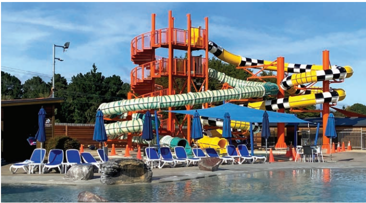
LAKE TAUPO HOLIDAY RESORT