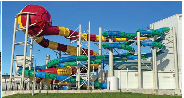
SPLASH PALACE, INVERCARGILL